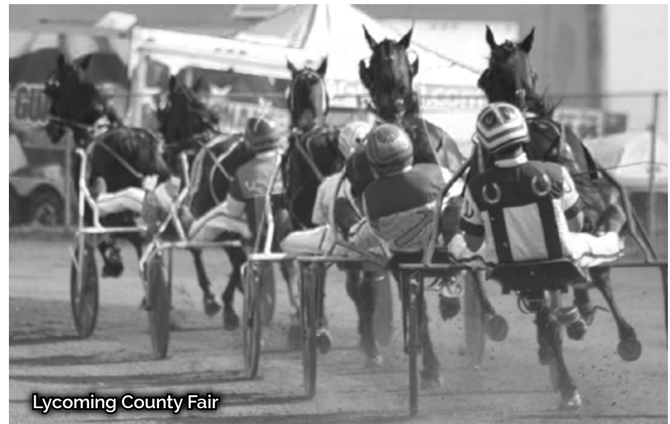
Lycoming County Fair